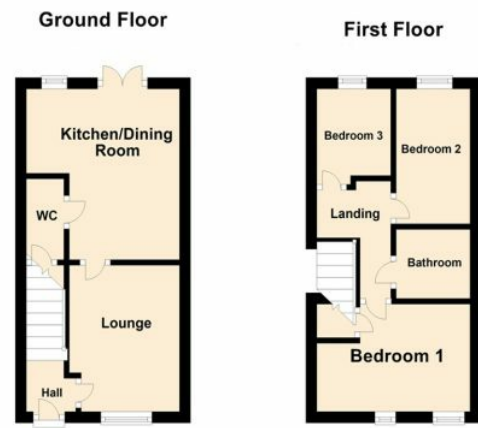
For Illustration Purpose Only. Not To Scale

These particulars are believed to be correct but their accuracy is not guaranteed and they do not form part of any contract. All measurements are approximate and are generally taken from the widest points. No item of a mechanical or working nature (e.g. any central heating installation) has been tested by us and accordingly no guarantee is given and any potential purchaser should satisfy himself in that respect. Any photographs are for the purpose only of illustration and must not be interpreted as giving any indication of the extent of the property for sale or of what is included in the sale.